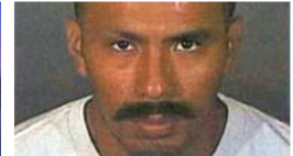
Former shot-caller is now spilling gang's secrets