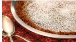
Crack Pie: It's love at first bite