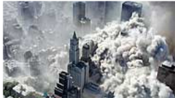
Chilling aerial photos of 9/11 attack released| Photos