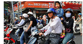
Helmets are a fashion must-have in Vietnam