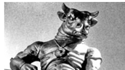
Exhibit celebrates effects wizard Ray Harryhausen