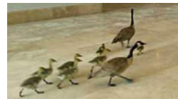
Canada geese tour the Norton Simon Museum